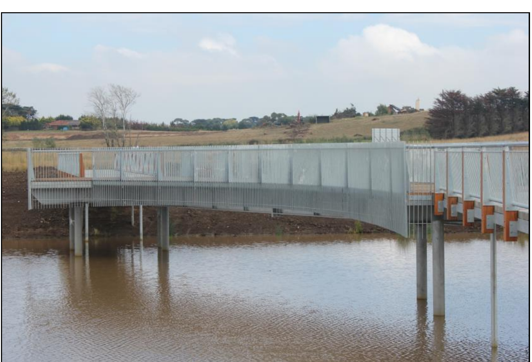
A great example of a successful design and construct contract!