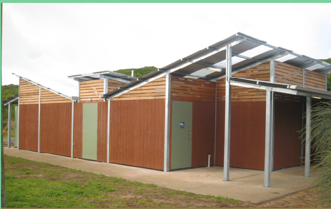
Yambuk Caravan Park Restroom & Shower Block

The restroom facility incorporated disabled access cubicles, showers and a laundry for the many tourists staying at the caravan park.