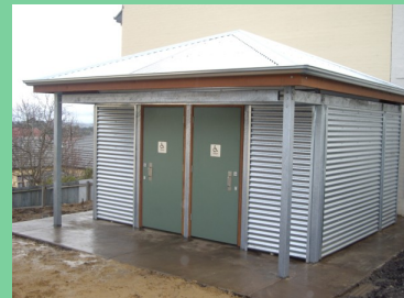
Twin Disabled with Gable Roof