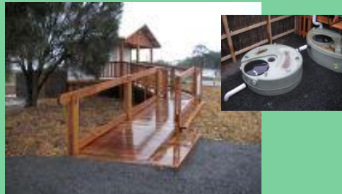
Twin Disabled with Hybrid Waste System