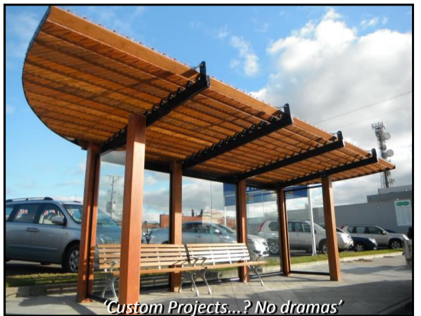
'Custom Projects...? No dramas'