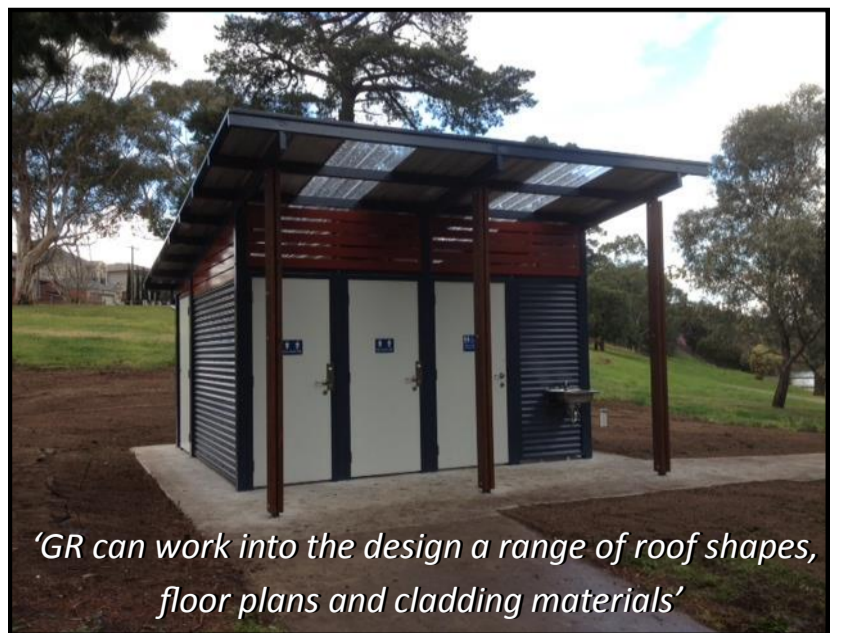
'GR can work into the design a range of roof shapes, floor plans and cladding materials'

Major Projects needed a ticket box designed and installed within six weeks to accommodate the looming Soccer match to be held at Morshead Park between the new Melbourne Franchise and Sydney City. GR worked through the design criteria with council then designed, engineering, fabricated and installed the ticket box.