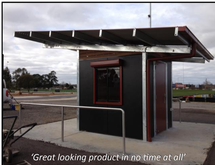
'Great looking product in no time at all'